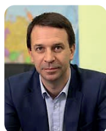
Grigory Vladimirovich Trubnikov (Russian Federation)