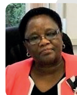
Tebello Nyokong (South Africa)